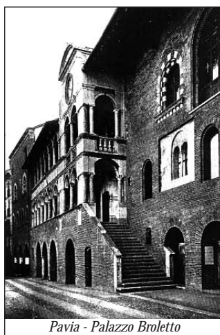
Pavia - Palazzo Broletto