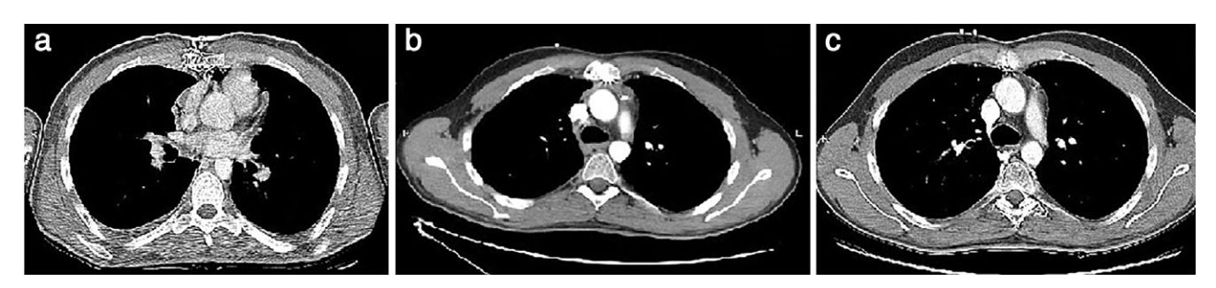
Figure 3. Postoperative CT scans at 1 month (a), 6 months (b) and 12 months (c).