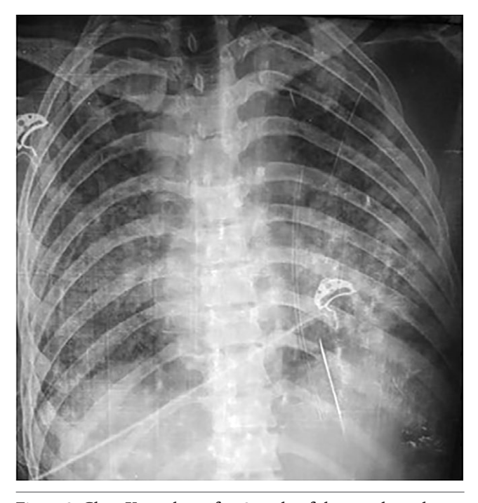
Figure 3. Chest X-ray done after 2 weeks of therapy showed resolution of the alveolar opacities.