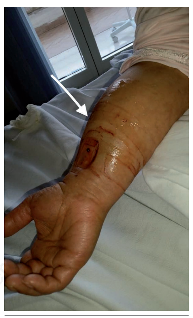
Figure 1. Painful haematoma covering the volar side of the right arm. Site of puncture and TR-band application are clearly visible. Arrow indicates pseudoaneurysm.

The ultrasonography evaluation showed a hypoechoic cystic structure (20x20 mm) nearby the third distal of the radial artery. The colour doppler analysis showed blood flow in the cystic mass (supplied by the radial artery) with a swirling motion pattern, known as yin-yang sign, as shown in Figure 2. The continuous wave doppler aligned on the neck of the cystic mass showed the to-and-fro pattern, thus the diagnosis of RAP was made (Figure 2). Two attempts of treatment by local ultrasound-guided compression applied for 30 min were performed, both of them failed. Then, a local compressive bandage was applied for 24 h but, at the end of this time, the pseudoaneurysm was still supplied by the radial artery. At this point, as for team discussion, surgical treatment was