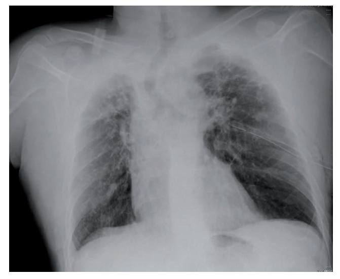
Figure 2. Chest X-ray after tube thoracostomy.