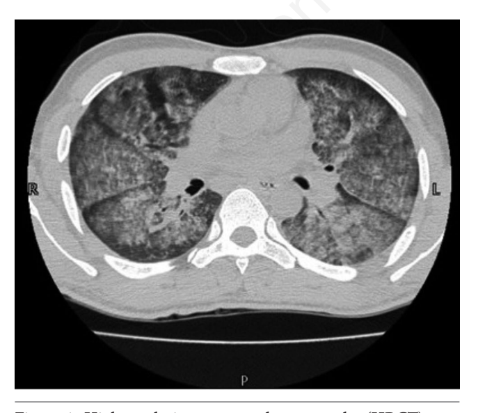
Figure 1. High resolution computed tomography (HRCT) scan chest of Patient 1 showing diffuse bilateral alveolar infiltrates.

A 26-year-old female presented with four years long history of cough along with scanty hemoptysis on and off. Her cough and dyspnea had worsened in the 3 months prior to presentation. She also gave history of recurrent anemia and multiple blood transfusions. On examination, her oxygen saturation was 86% on room air and she had bilateral fine crackles more marked at lower parts of chest. Her hemoglobin at presentation was 8.0 g/dl. Her Chest X-ray and CT scan findings were suggestive of interstitial lung disease. She was transfused two units of packed cells and an open lung biopsy was done. Biopsy findings were consistent with IPH. This patient was started on steroids but she did not respond. She died few weeks later with respiratory failure secondary to hospital acquired pneumonia.