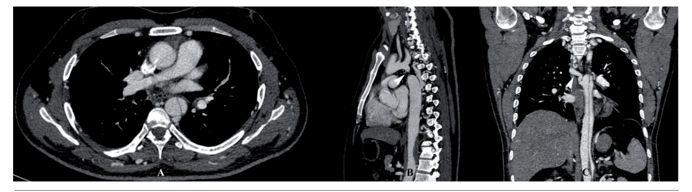
Figure 2. A) Computed tomography (CT) aortogram (axial view) showing the presence of an intimo-medial flap in the descending thoracic aorta dividing the lumen into a smaller true lumen and a larger false lumen. B) CT aortogram (sagittal view) showing a short segment complete interruption of the aortic arch (white arrowhead) just distal to the origin of left sub-clavian artery. C) CT aortogram (coronal view) showing the presence of a linear intimo-medial flap in the descending aorta extending distal to the interrupted segment. In addition, there is a presence of a large collateral channel (white arrowhead) supplying the interrupted segment of descending aorta.