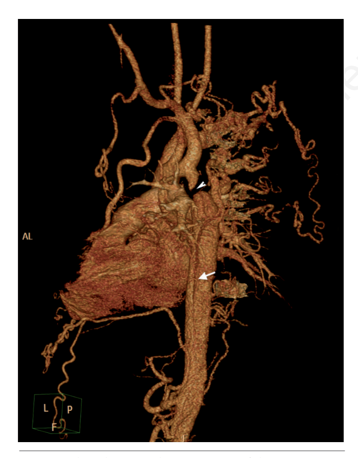
Figure 3. Three-dimensional reconstruction of the CT aortogram showing a short segment complete interruption of the aortic arch (white arrowhead) just distal to the origin of left sub-clavian artery along with the presence of a linear intimo-medial flap (white arrow) in the descending aorta distal to the interrupted segment.

the graft segment anastomosed to DTA in a continuous manner such that both true and false lumen shall be perfused. He has been under follow-up for the past 1 year and has been markedly asymptomatic since then.