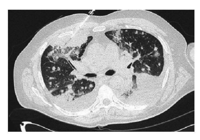
Figure 2. CT-guided transthoracic biopsy. The bioptic needle is sampling the right upper lobe lesion.