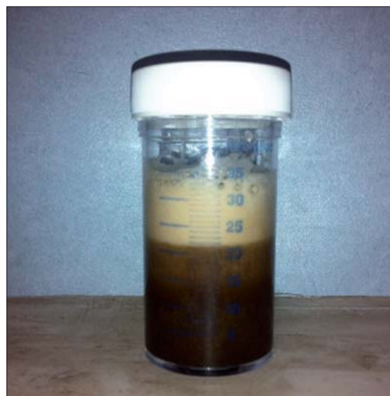
Fig. 2. - Image showing the container where we collected the brownish and turbid, but surprisingly odorless fluid taken during TBNA. As it is a very viscous fluid, we had to apply a considerable amount of suction force through the syringe connected to the needle during TBNA in order to collect as much of it as possible.

Clearly, if we decide to adopt a simple TBNA as the first approach treatment for suspected bronchogenic cysts, it will be necessary to program a careful clinical and radiological follow up and, therefore we must be prepared to perform safer therapeutic interventions in the event of complications or recurrence.