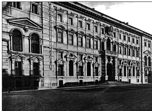
Pavia - Almo Collegio Borromeo