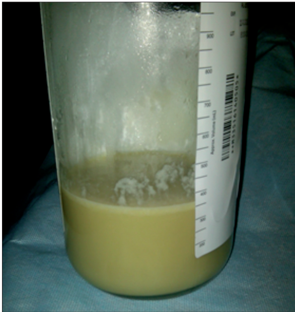
Fig. 2. - Thick milky, tan coloured pleural effusion.