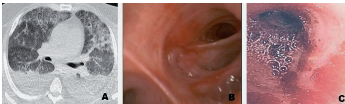
Figure 2. A) High resolution chest CT scan highlights large lung consolidations at the bases mixed with widespread ground glass areas. B,C) Endoscopic pictures of markedly hyperemic mucosa, with superficialization of submucosa vessels and presence of secretions mixed with live blood.