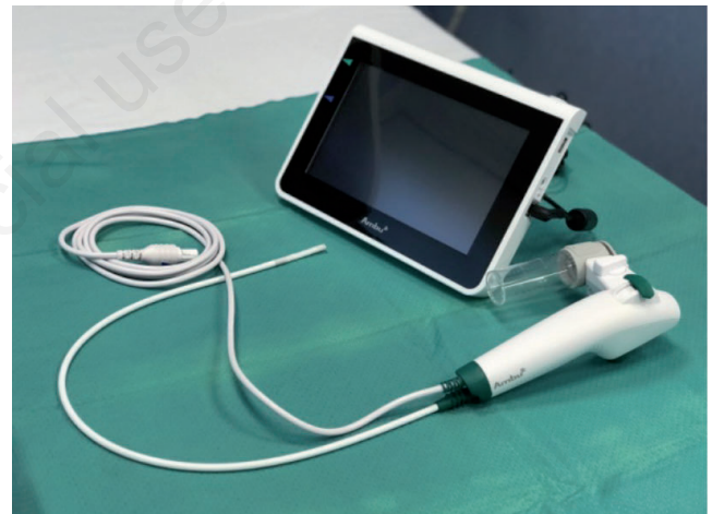
Figure 3. Disposable single-use bronchoscope, with dedicated monitor.

Preparation for videobronchoscopy consists of the dressing phase (Table 2) performed in a room outside the isolation room, performing the procedure in front of another trained operator in order to avoid mistakes. The dressing procedure, in the experience