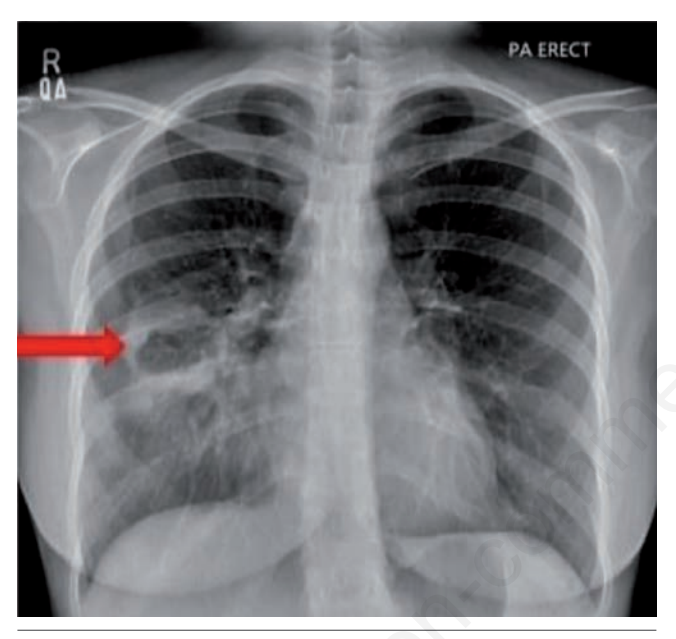
Figure 1. Chest radiograph showing cavity in right mid lung zone.

vocal cords, the trachea was coated with white patches (Figure 2) a,b) till the right main bronchus, Bronchoalveolar lavage (BAL) was done from right upper and middle lobe and were sent for microbiological examination and Xpert MTB/Rif. Endobronchial biopsy was taken from the right middle lobe bronchial wall. The BAL Acid Fast Bacilli (AFB) smear and Xpert MTB/Rif came out to be positive without rifampicin resistance and the biopsy showed caseating granulomas (Figure 3). BAL Galactomanan came out 0.16, AFB culture showed pan sensitive Mycobacterium tuberculosis while bacterial culture was negative. The patient was started on anti-tuberculous therapy and was followed up in the clinic. The patient was treated for tuberculosis disease with first line antituberculosis drugs including Isoniazid, rifampicin, pyrazinamide and ethambutol. The patient improved clinically became afebrile, regained her voice and responded to treatment well Just after 2 weeks of therapy. She is currently in intensive phase of therapy.