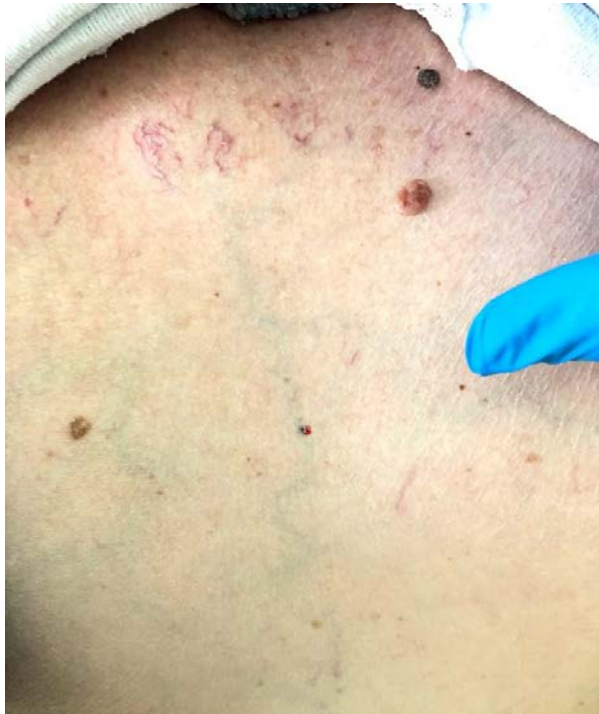
Figure 1. Superficial collateral venous pathways and angiectasias along the anterior trunk.