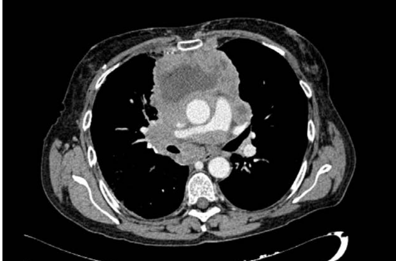
Figure 3. CT-scan showing the mediastinal mass and enlarged mediastinal lymph nodes.