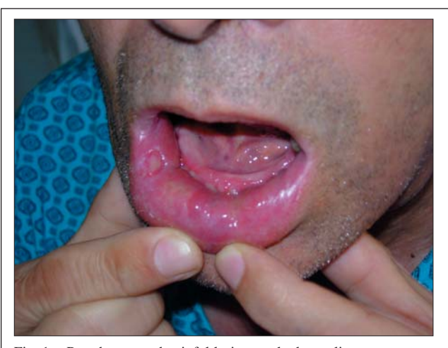
Fig. 1. - Protuberant and painful lesion on the lower lip.

mental 3x3 cm, right submental 3x2 cm and 2x2 cm, right supraclavicular 1x1 cm. With the exception of inspiratory rales, respiratory and other system physical examinations were normal.