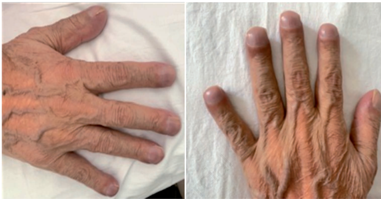
Figure 1. Finger clubbing.

lioid non-caseating granulomas and fibrosis compatible with sarcoidosis. Serologic markers for viral hepatitis HBC, HCV and HDV did not reveal infection. Serologic markers of KLM, ANA, ASMA, AKLM-1, ALC-1 for autoimmune hepatitis were negative. Pulmonary function tests were within normal limits (FEV1:106%,