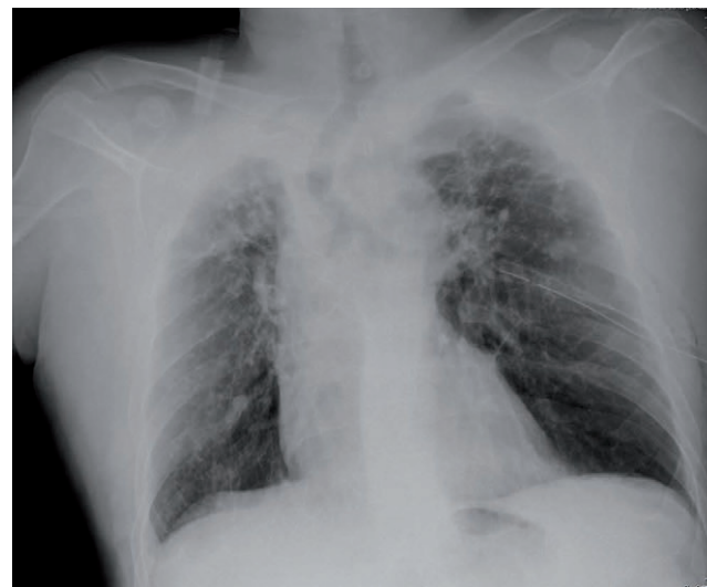
Figure 2. Chest X-ray after tube thoracostomy.