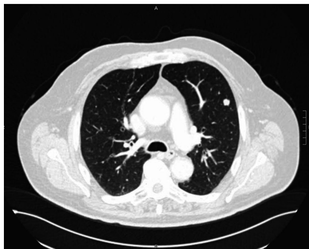
Figure 1. Computed tomography of thorax showing left lung nodule (axial view).

Interventional Pulmonology has grown in recent years due to the introduction of endobronchial ultrasound (EBUS) as a staging modality for lung malignancies and as a diagnostic tool for the mediastinal involvement. More recently, the efficacy and utility of the esophageal approach using the EBUS scope (EUS-B) has been described to access nodes and lesions which are accessible through it. The transesophageal and gastric use of the EBUS scope (EUS-B) was first reported in 2007 [4]. Subsequent papers proved that the dual use of EBUS, through the tracheal-bronchial tree and the esophagus could be performed in the same setting with a high diagnostic