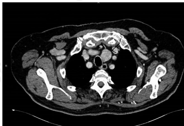
Figure 2. Contrast enhanced computed tomography thorax image showing oval opacity in left paratracheal area (axial view).