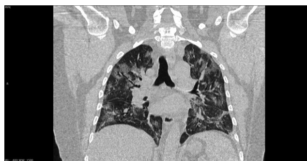
Figure 3. Coronal reconstruction in lung window showing diffuse bilateral infiltrations.