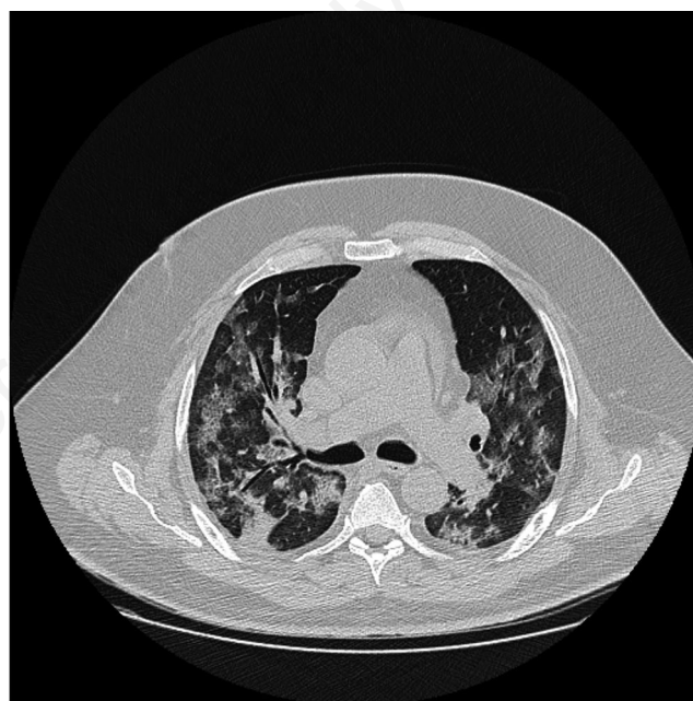
Figure 2. Chest computed tomography showing diffuse bilateral ground-glass opacities.

SARS-CoV-2 is a positive-sense RNA virus, member of the coronavirus family, with a transmissibility similar to other respiratory viruses via large droplet transmission. Upon entering the host's organism, the virus binds to angiotensin-converting enzyme 2 (ACE 2) receptor on type II alveolar cells and intestinal epithelia, infiltrates the cell and starts replication. The main clinical findings include fever, upper and lower respiratory symptoms such as dyspnea, constitutional symptoms, and less commonly gastrointestinal symptoms (up to 10%). Physical examination is generally non-specific. The typical disease course consists of an incubation period of 4 to 14 days; in severe cases, dyspnea is recognized around 6 days post exposure, admission to Hospital after 8 days and ICU admission after 10 days post exposure [1,3].