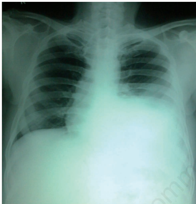
Figure 1. X-ray chest PA view showing left sided moderate pleural effusion.

A repeat clinical examination and additional workup for identification of primary site including examination of oral cavity and ENT region by laryngoscopy, x-ray paranasal sinus, upper gastrointestinal tract scopy etc. was normal. Further workup with immunohistochemistry and PET CT could not be done due to lack of such facilities at our centre. The case was finally diagnosed as metastatic squamous cell carcinoma at pleura with unknown primary and was referred to the oncologist for further management. However, before a specific therapy could be planned, patient was again extensively enquired about any other significant symptom