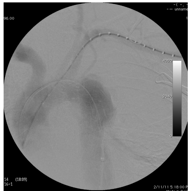
Figure 2. - Intraoperative imaging of the saccular aneurysm and the guide wires inserted from the left subclavian and femoral arteries.

Conservative treatment of aneurysms after surgical coarctation repair remains unpredictable and was associated with a 100% rate of rupture