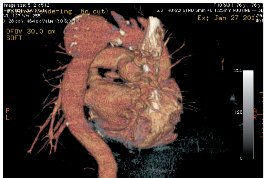
Figure 1. - Preoperative 3D reconstructed chest CT-scan depicting the saccular aneurysm located immediately after the origin of the left subclavian artery. At the distal end of the aneurysm notice the barely visible end-to-end anastomotic line.

aneurysm beginning from the end of the aortic arch with 54mm length and maximum anteroposterior and transverse diameters of 46 and 51 mm, respectively (Figure 1). The dimensions of the ascending and the descending aorta were normal. The patient