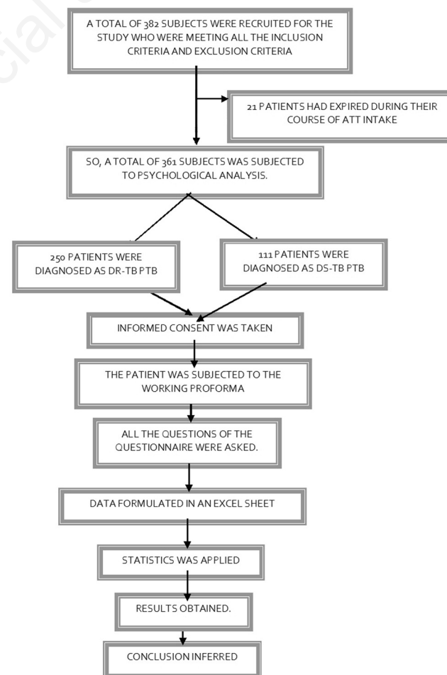
Figure 1. Flow pattern of the enrolled patients.

Statistical analysis was carried out with SPSS ver 21. A \chi^2 test was used to compare and analyze various characteristics of drug-resistant and drug-susceptible pulmonary tuberculosis; p-values <0.05 were considered significant.