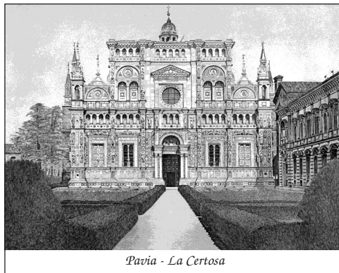
Pavia - La Certosa