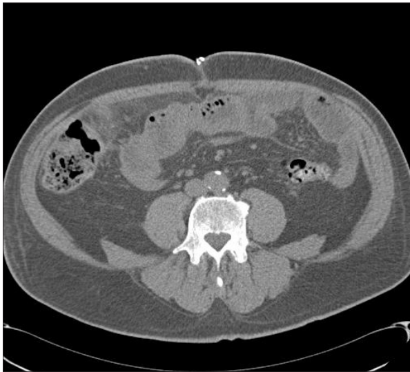
Fig. 1. - Abdominal CT scan: peritoneal thickening and nodular enhancement.

ally small and composed of multinucleated giant cells rarely containing cytoplasmic inclusions (asteroid or Schaumann bodies), epithelioid histiocytes and few lymphocytes. Some of them were centrally occupied by nodular hyaline scar with or without fibrinoid necrosis (fig. 2). Special stains (Ziehl-Neelsen, Grocott and PAS) did not show the presence of an infectious agent. The granulomas appear both in the samples of the omentum and of the peritoneum. Pulmonary lung function tests were as follows: FVC 3.35 L (84.5% predicted) FEV 1 2.94 L (87.5% predicted) FEV 1 /FVC 87.7, DLCO 83.6%. A needle lung biopsy was performed later and revealed the absence of neoplastic cells and a cytologic image was suggestive (but not conclusive) of sarcoidosis. The patient refused to undergo open lung biopsy or corticosteroid therapy. He did not attend the planned follow-up.