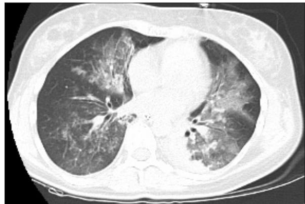
Fig. 2. - Thoracic CT.