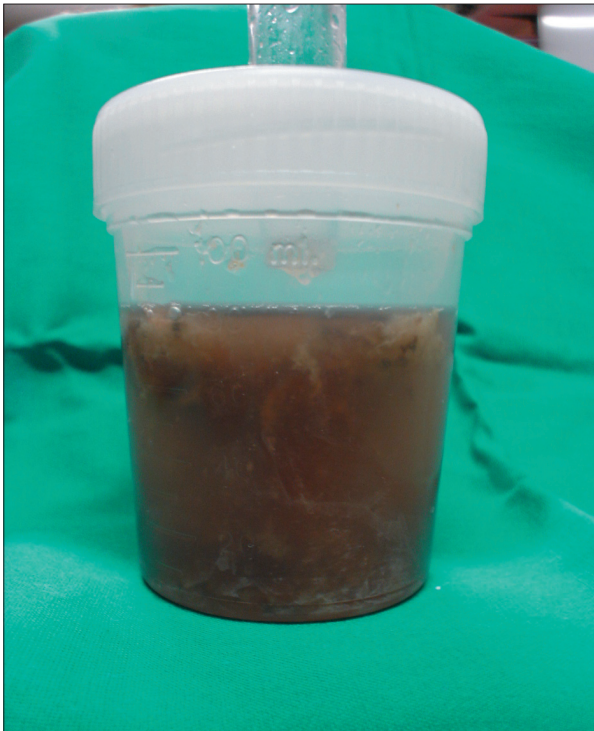
Fig. 1. - Bronchoscopic BAL obtained at the time of admission to the ICU.

segments, consistent with respiratory distress syndrome (figure 2).