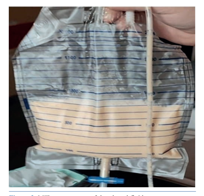
Figure 3. Milky appearance of the pleural fluid.

Diagnostic thoracentesis of both right and left pleural effusions revealed milky/white-appearing fluid (Figure 3), which was exudative according to Light's criteria. In particular, the fluid total protein (3.8 g/dL)/serum total protein (5.94 g/dL) ratio was 0.63 (>0.5), and the fluid lactate dehydrogenase (193