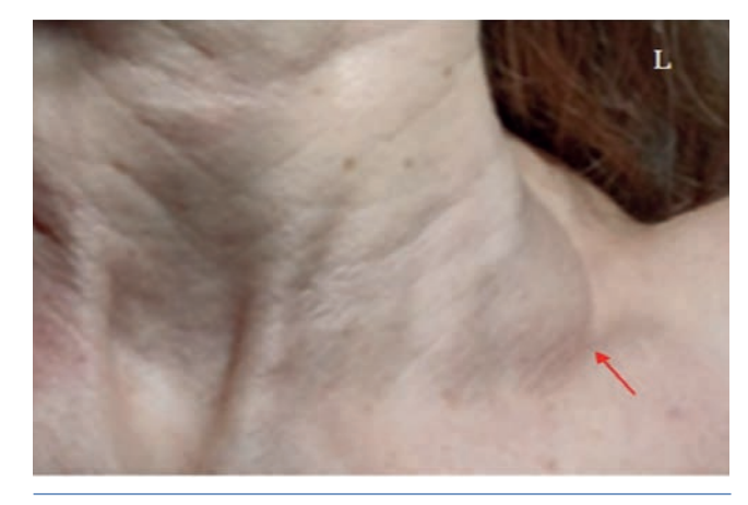
Figure 1. Palpable painless mass over the left clavicle (red arrow).

On presentation, the patient was afebrile and hemodynamically stable. She had an arterial blood pressure of 114/75 mmHg and a heart rate of 90 beats/minute. Peripheral lymph nodes were not palpable, except for the small swelling over the left clavicle with expansion on the left side of the neck. On auscultation, diminished lung