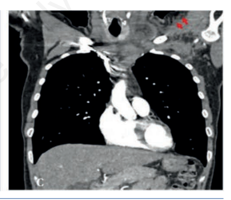
Figure 2. Bilateral pleural effusions on admission chest-x-ray (A) and on axial image of the thorax in the contrast-enhanced CT (red arrows) (B) and reveal of the vague inflammatory area at the left side of the neck on the coronal image (red arrowheads) (C).

sounds were found in both lung bases without any additional lung sounds. Heart sods were clear during the examination and there was no evidence of peripheral edema, clubbing, or other abnormalities. The rest of the physical examination was unremarkable.