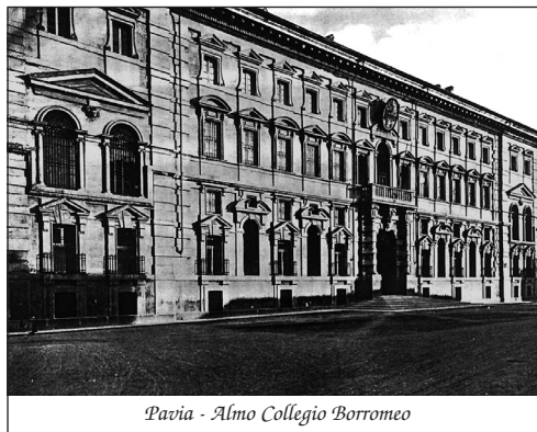
Pavia - Almo Collegio Borromeo