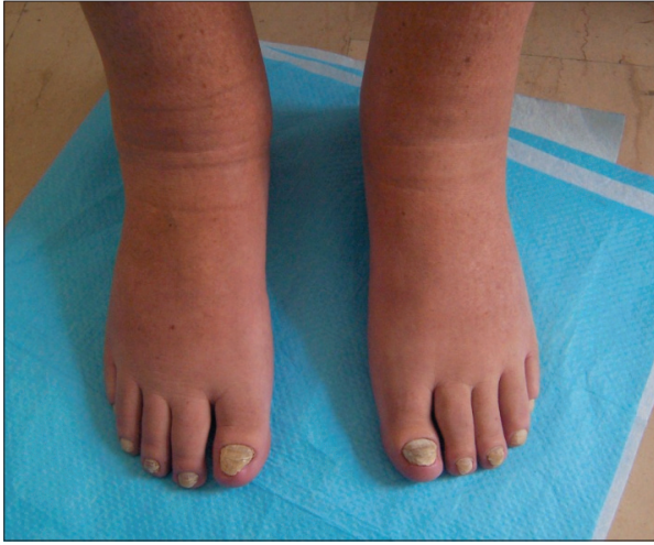
Fig. 3. - Bilateral lower limb edema and nail changes in Case #2.