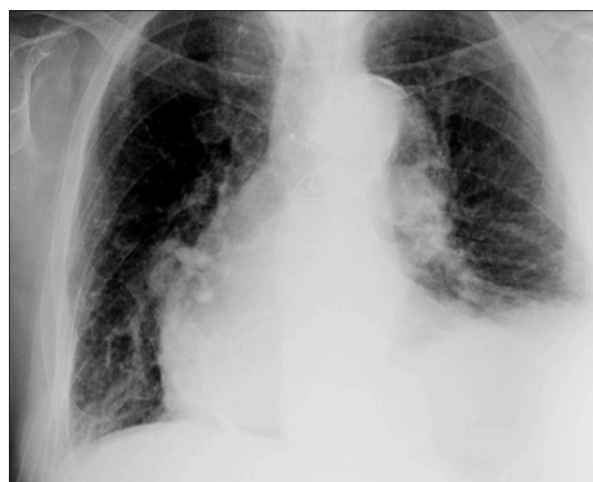
Fig. 2. - Chest x-ray on admission in Case #2. Note the prominence of the right heart profile.

On admission to our hospital, he presented bilateral pleural effusions (figure 2), moderate ascites and severe non-pitting leg and arm edema involving both hands and feet, as well as head and neck swelling. The remaining systems were normal.