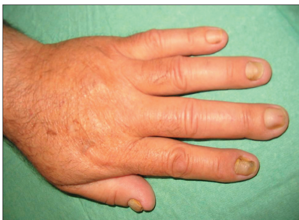
Fig. 1. - The major clinical feature of Yellow Nail Syndrome: typical nail changes in Case #1.

At further daily clinical examinations, we noticed the presence of brown-yellowish, thickened nails, showing marked curving and transverse ridging. The lunulae were absent, and there was a distinct hump on all nails (figure 1). YNS was then suspected.