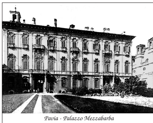
Pavia - Palazzo Mezzabarba