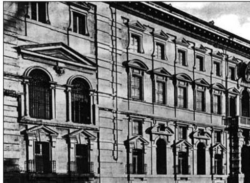
Pavia - Almo Collegio Borromeo