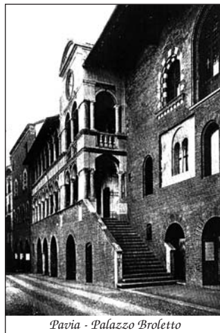
Pavia - Palazzo Broletto