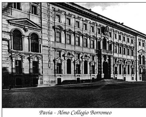
Pavia - Almo Collegio Borromeo