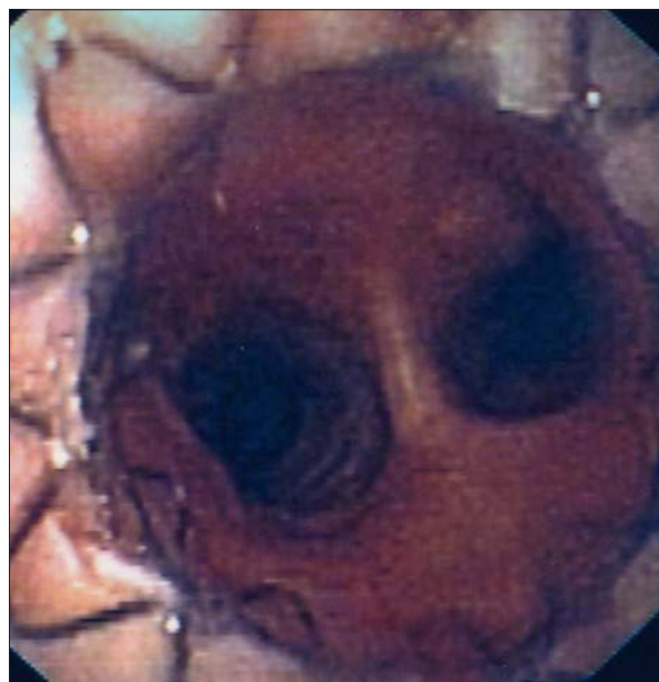
Fig. 2. - After complete stent deployment the fistula has been sealed and the airway lumen has been restored. The distal edge of the prosthesis is situated few millimeters above the main carina.

cluding Dumon silicone, Dynamic Y shaped and covered auto-expandable metallic stents have been reported to give good results in cases of TEF, we would opt for auto-expandable stents because of their flexibility and better conforming to the irregular airways we usually encounter in a TEF. Homogeneous radial force exerted to the tracheal wall from the mesh of the stent, prevents it from migrating and ensures adequate sealing of the fistula.