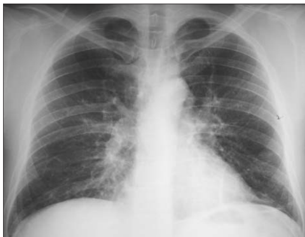
Fig. 1. - Chest-X-ray. Diffuse reticulonodular shadowing (patient 2).

tent of centrilobular nodules could be related to the degree of inflammation and extent of macrophages in respiratory bronchioles, whereas the ground-glass shadowing could be attributed to macrophage accumulation in alveolar ducts and alveoli [13, 14]. In other words, ground-glass attenuation could reflect “smoker’s alveolitis” whereas micronodules would correspond to respiratory bronchiolitis [15, 16] (as can be observed in the morphologic appearance from a surgical biopsy performed on patient 3 - figure 3).