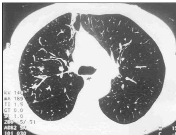
Fig. 1. - HRCT of the lung revealed cylindrical bronchiectasis throughout the upper lobe.

tial laboratory data revealed a WBC count of 7 \times 10^3 \mu\text{l} , a slight decrease of hematocrit to 35% and platelet count of 250 \times 10^3 \mu\text{l} . Examination of the upper respiratory tract revealed blood on the vocal cords emerging from the trachea with no other abnormalities. A standard chest radiograph revealed an increased density of the upper lobe with dilated bronchi, which suggested bronchiectasis. Flexible bronchoscopy revealed fresh blood emerging from the bronchi of the upper lobe. An High Resolution Computed Tomography (HRCT) of the lungs revealed volume loss and cylindrical bronchiectasis throughout the upper lobe without other findings (fig. 1). On retrospective examination of the patients CT studies, multiple nodular lesions were found to