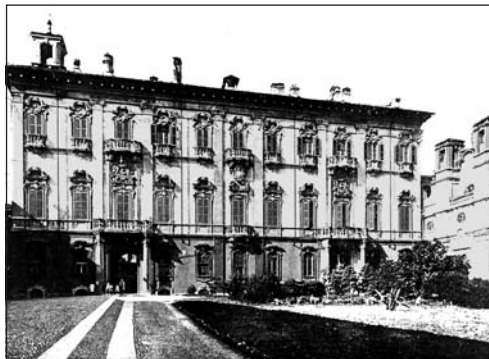
Pavia - Palazzo Mezzabarba