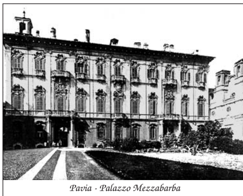
Pavia - Palazzo Mezzabarba