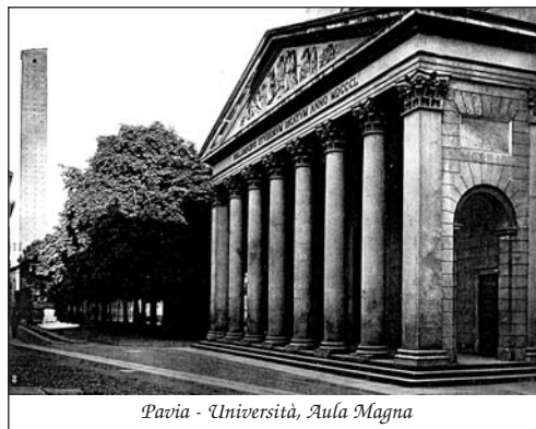
Pavia - Università, Aula Magna