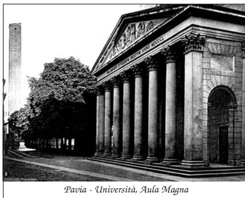
Pavia - Università, Aula Magna