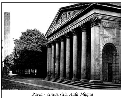
Pavia - Università, Aula Magna