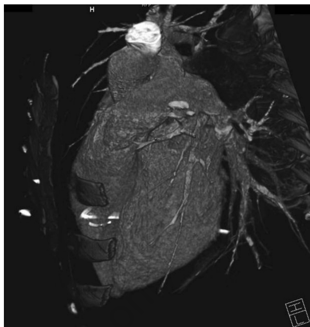
Figure 1. CT Angiography with 3D reconstruction showing the needle crossing the intraventricular septum (lateral view of the heart).