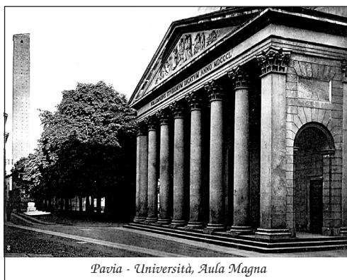
Pavia - Università, Aula Magna