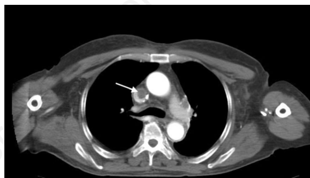
Figure 2. Contrast enhanced computed tomography (axial section) showing presence of a hypodense filling defect in the superior vena cava (white arrow) causing marked luminal narrowing along with presence of pacemaker lead.

The occurrence of thromboembolic complications following transvenous pacemaker implantation has been reported to occur in 0.6-3.5% with SVC syndrome developing in less than 0.1% of patients [5]. Wertheimer et al. [6] had first described pacemaker lead induced SVC syndrome in 1973. Since then, various reports and case series have highlighted this rare but a serious complication carrying a significant morbidity and mortality.