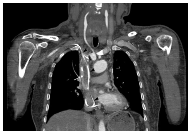
Figure 3. Contrast enhanced computed tomography (coronal section) showing presence of a linear hypodense thrombus in the superior vena cava causing 70-80% luminal narrowing (white arrow) with the presence of pacemaker leads (black arrow heads).