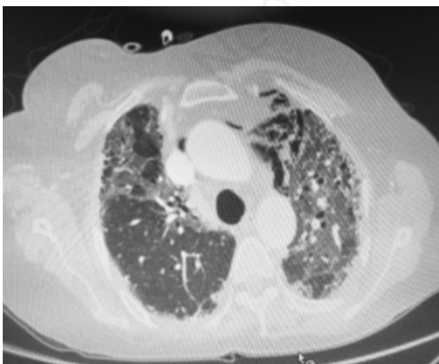
Figure 2. Chest CT showing bilateral diffuse cystic emphysema, ground-glass opacities, traction bronchiectasis, and interstitial fibrosis.