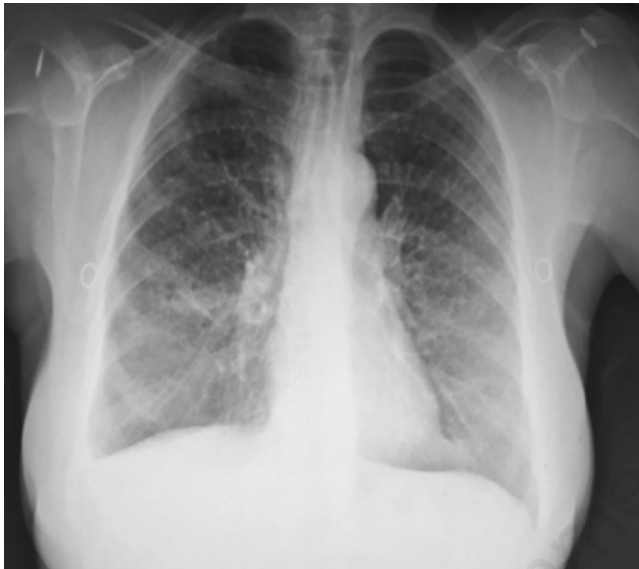
Figure 1. Chest x-ray revealing interstitial pattern and ground glass opacities at the middle and lower lung zones.

lung zones (Figure 1). CT revealed diffuse cystic lesions, ground glass opacities, traction bronchiectasis, and reticular opacities in both lungs (Figures 2 and 3). Sputum smear, cytology, and culture for bacteria, mycobacteria, and fungus were negative. Anti-histone antibody was 4.6 units. Following ABG values in the second day were as follows: pH: 7.38, pO_2 : 52.9 mm Hg, and pCO_2 : 38.5 mm Hg while the patient received nasal 8L/min oxygen. BiPAP was started and intravenous methylprednisolone 60 mg/day bid was commenced. The ABG values on the third day were as follows: pH: 7.41, pCO_2 : 49.3 mm Hg, pO_2 : 49.6 mm Hg and pH: 7.40, pO_2 : 50.1 mm Hg, pCO_2 : 49.3 mm Hg. The patient was transferred to the intensive care unit and mechanical ventilation was started. Final diagnosis was respiratory insufficiency due to bleomycin lung toxicity. The patient deceased on the sixth day of her admission in the intensive care unit.